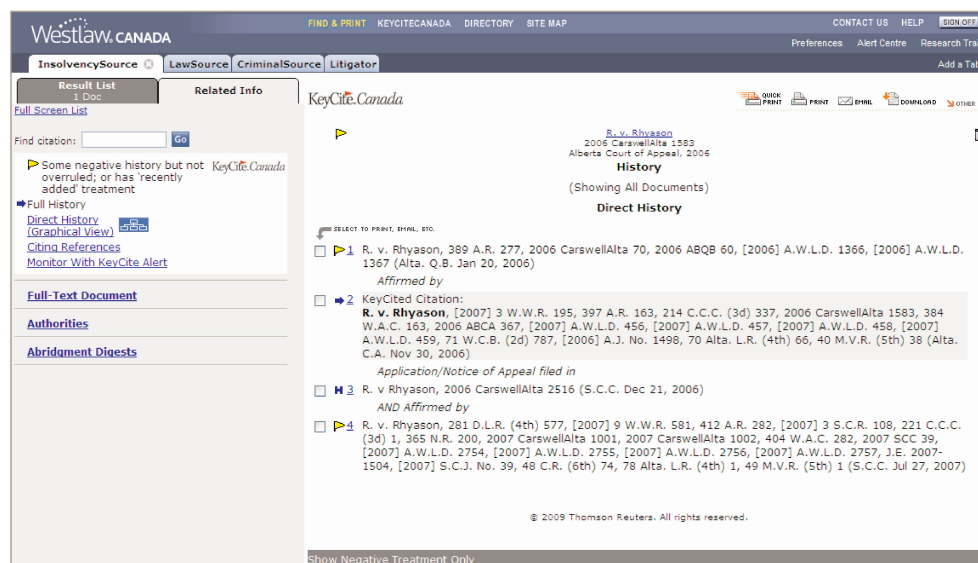
Figure 1) KeyCite History Display showing Application/Notice of Appeal Filed

Any decision where there is an appeal pending to the S.C.C. will have a yellow flag attached to it— to warn users that the final outcome of the case is in question. This yellow flag will be removed if and when Leave to appeal is refused by the S.C.C. or when the S.C.C. issues a decision affirming the lower Court decision.