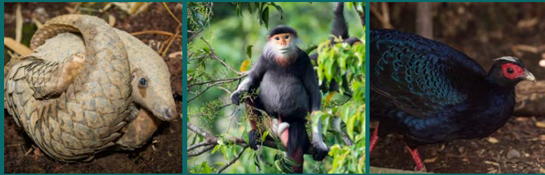
Protecting species in Vietnam: The Sunda Pangolin, Red-shanked Douc, and Vietnam Pheasant are all classified as Critically Endangered