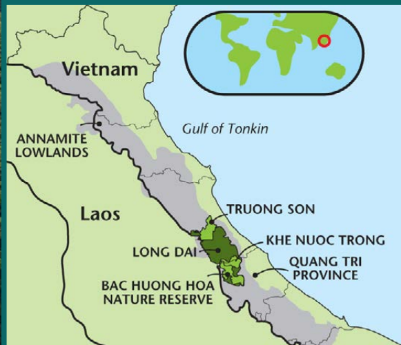
Map of Khe Nuoc Trong, Vietnam

KNT contains a number of threatened species listed on the IUCN Red List, including at least 4 Critically Endangered, 6 Endangered and 16 Vulnerable species.