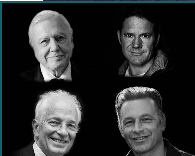
World Land Trust's patrons include: Sir David Attenborough, Steve Backshall, David Gower, Chris Packham